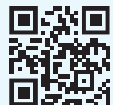
MyBlueKC mobile app

Please call Blue KC Customer Service at the number listed on your member ID card. Manage your Blue KC coverage on-the-go by downloading the MyBlueKC mobile app.